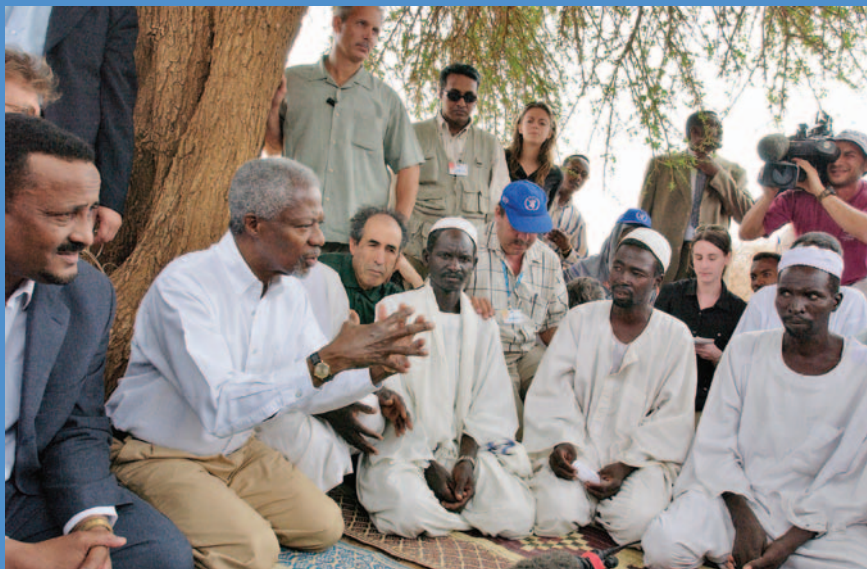
Secretary-General Kofi Annan (second from left) meets with community leaders at the Zam Zam Internally Displaced Persons Camp, in the Darfur region of Sudan.

University for Peace Costa Rica Headquarters Apdo. 138-6100 Ciudad Colon, Costa Rica Tel: +506-205-9000 Fax: +506-249-1929 Email: info@upeace.org Website: www.upeace.org